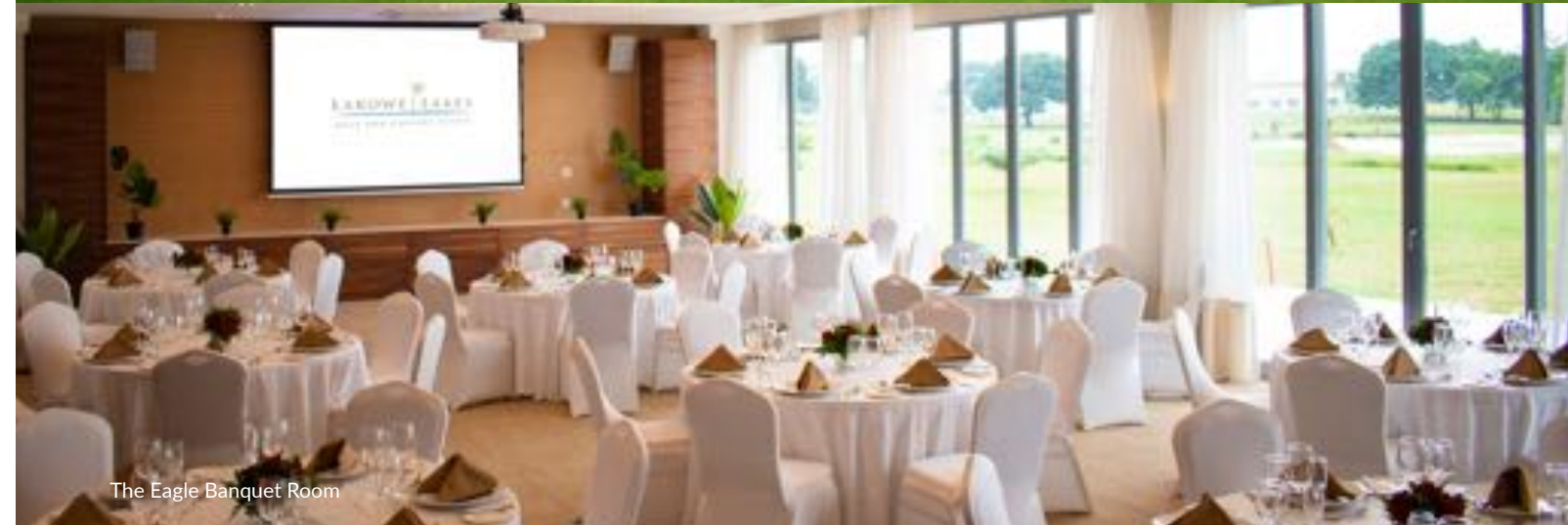
The Eagle Banquet Room