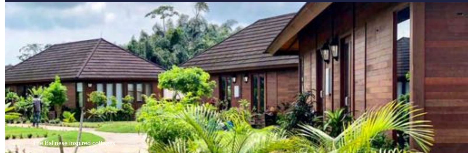
The Balinese inspired cottages