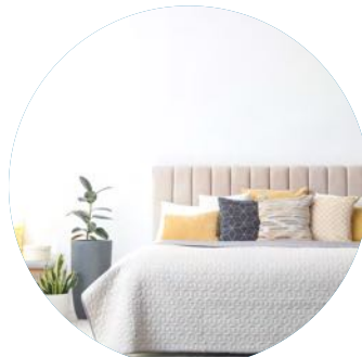
Hospitality Resort & Cottages