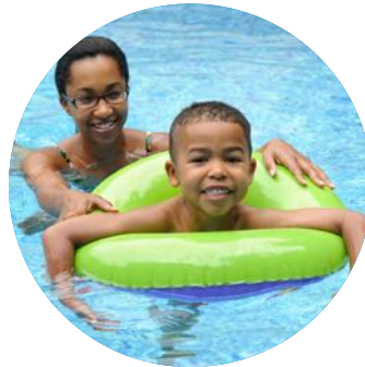
Access to Recreational Facilities

Some previous hospitality guests for corporate retreats have included: General Electric, Total, Nestle, Mckinsey & Company, IFC, e.t.c.