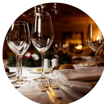
Onsite Dining and Other Entertainment Options