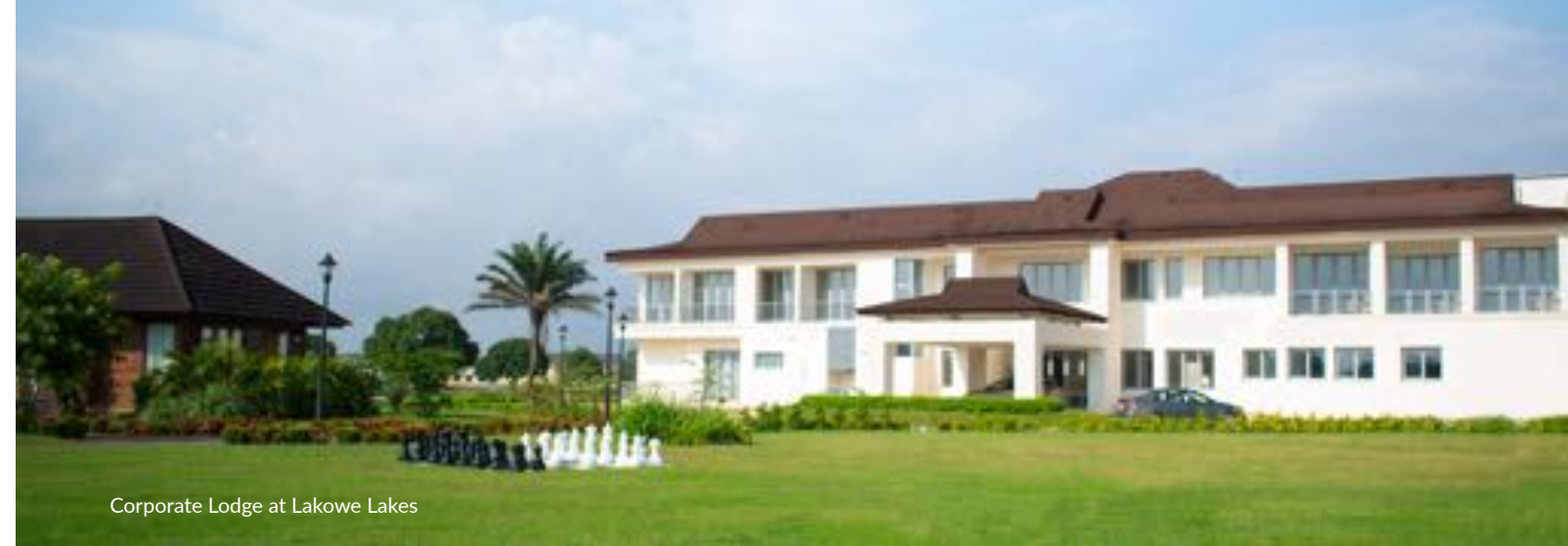
Corporate Lodge at Lakowe Lakes