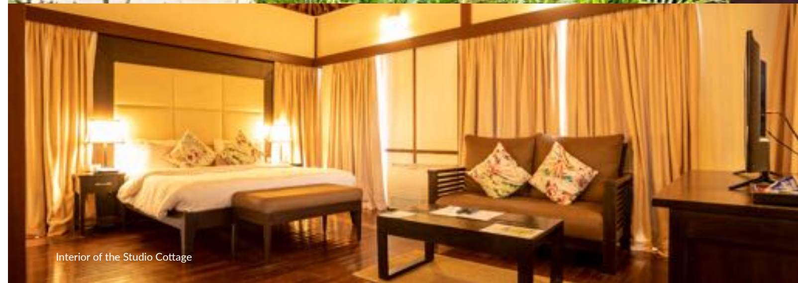
Interior of the Studio Cottage